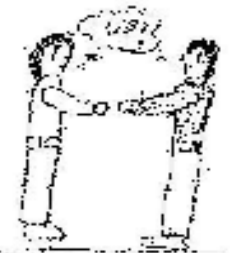
Take Notice Group

Have you heard about the Safer Places Project ? Shops in the Wokingham Borough have signed up to be places where people who feel under threat could go and feel safe and get support .