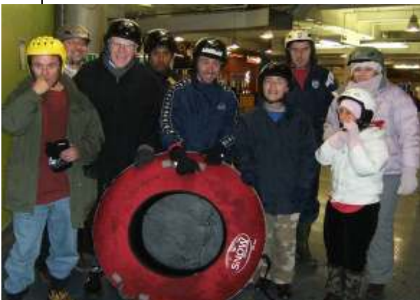
The Fearless Crew!

A week later on 28 th July, a group of fearless younger (and young at heart!) people with learning disabilities went to the Snowzone in Milton Keynes . Everyone had to dress up in very warm clothing because there was real snow to toboggan on! The toboggans were large circular rubber dinghies, and everyone worked really hard pushing and pulling them to the top of the slope, before the exciting and exhilarating ride back down again! Some people are planning to go back again because they enjoyed it so much!