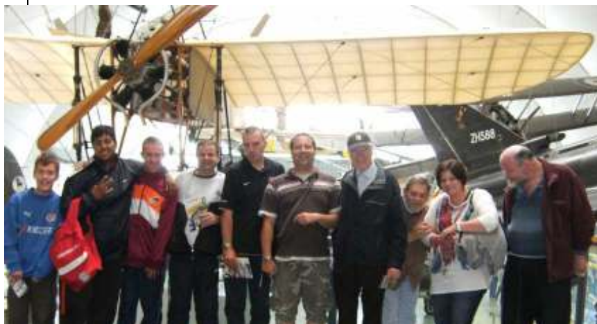
The gang at RAF Hendon