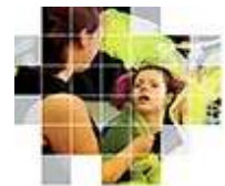
Involve me Practical guide How to involve people with profound and multiple learning disabilities (PMLD) in decision making and consultation

National Mencap have been working on a 3 year project called 'Involve Me'. This has resulted in a practical guide that aims to help people with profound and multiple learning disabilities be more involved with decision making and consultation.